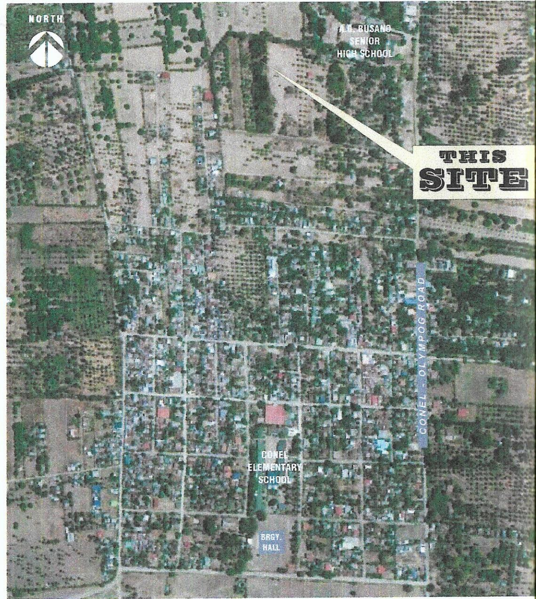
MAP OF BRGY. CONEL