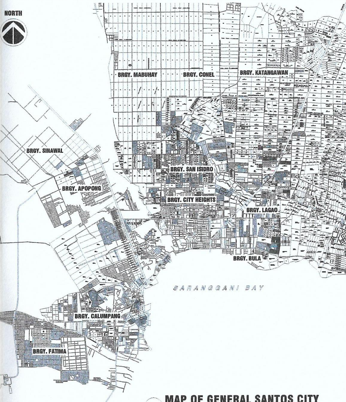
MAP OF GENERAL SANTOS CITY