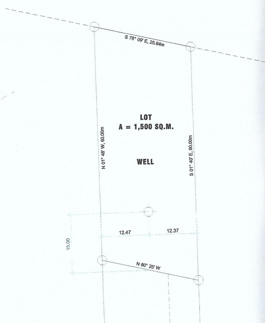
SITE DEVELOPMENT PLAN SCALE: 1 : 500 M