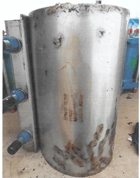
REPAIR CLAMP 150mm