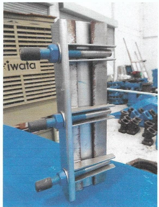
REPAIR CLAMP 50mm