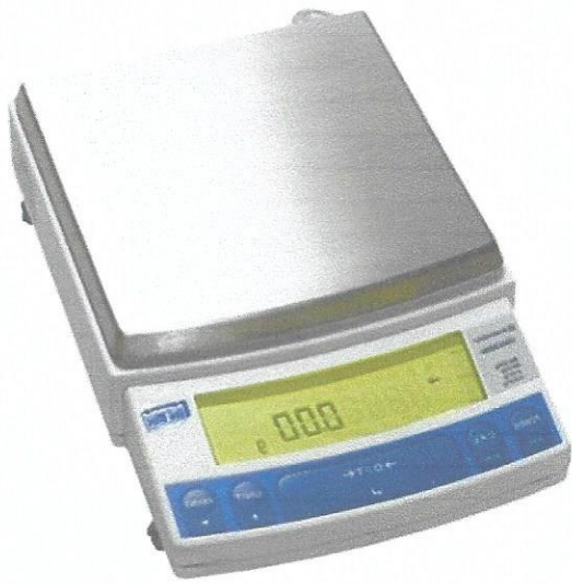
Digital Top Loading Balance