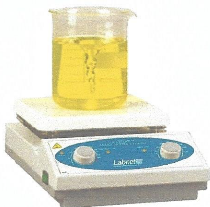
Hot plate stirrer