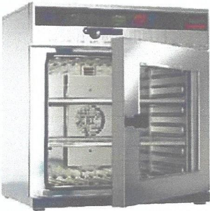
Hot Air Oven Sterilizer