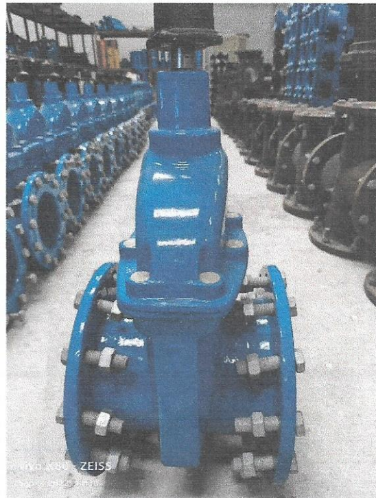
D.I. GATEVALVE 200MM F/F WITH HOT DIP GALVANIZE BOLTS AND NUTS; PN 16