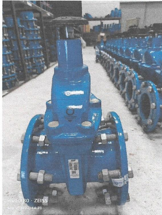
D.I. GATE VALVE 150MM F/F (WITH HOT DIP GALVANIZED BOLTS AND NUTS: PN 16)