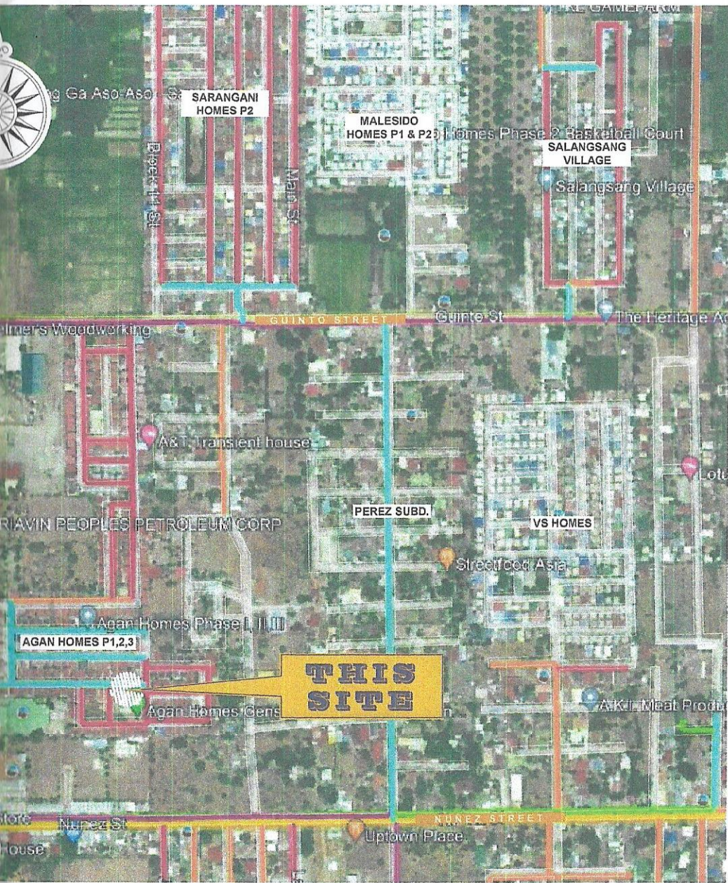
VICINITY MAP SCALE: NTS