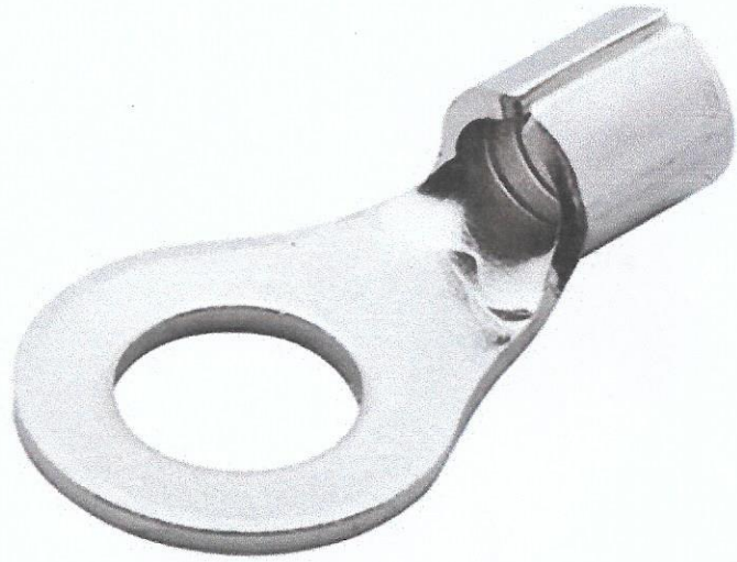
Eye Terminal #5.5-5