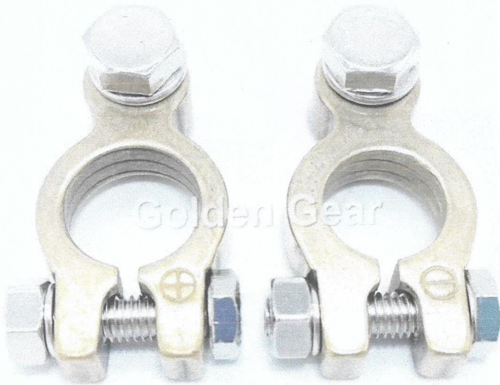
Battery Terminal – Heavy Duty